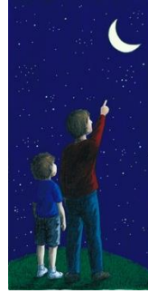
Psalm 8: 3-11 You gave us your world