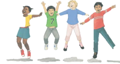
Psalm 19: 1-5 We praise you God