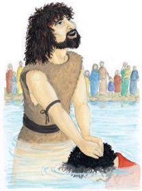
Jesus is Baptised Matthew 3: 13-17