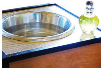
font and oil