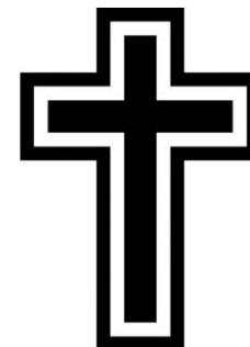
the sign of the cross