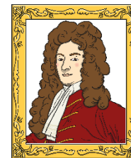
Sir Christopher Wren