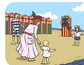
bank holidays and seaside holidays