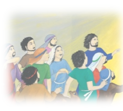
John 13 The Promise of the Holy Spirit