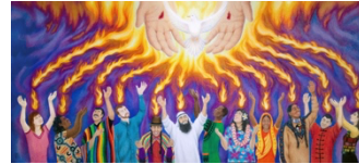
Acts 2: 1-4 Pentecost Day