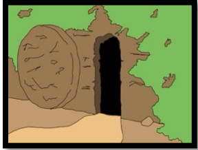
Luke 24: 1-9 The Resurrection