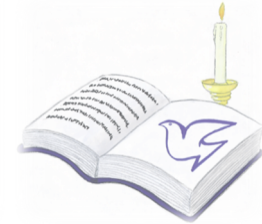
Romans 8: 22-28 Spread the word