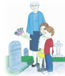
Thessalonians 4: 13-14 Passing on the Good News