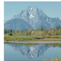
Smooth Water Surface