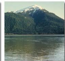
Wavy Water Surface